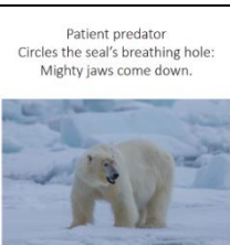
Patient predator Circles the seal's breathing hole: Mighty jaws come down.

Year 5 and 6 We have started to look at Haiku poetry in Class Three. We analysed and evaluated Haiku poems and looked at what makes certain poems effective. We have also performed poems to the rest of the class. Within our reading lessons, we have completed a character analysis of the important characters in the book. In Maths, we are looking at fractions, percentages and decimals. In PE, we've been swimming and improving our swimming strokes.